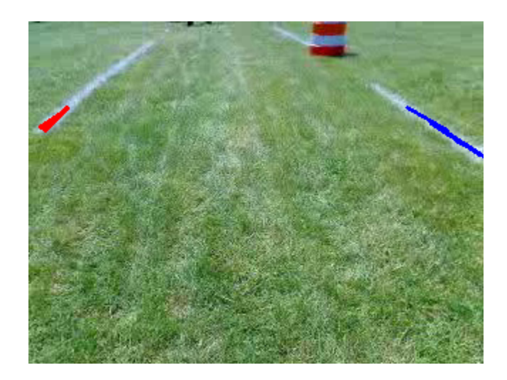
Figure 4: Initial frame with lines drawn