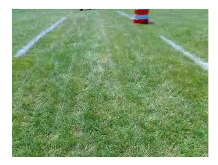
Figure 1: Initial image frame